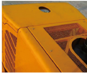
Good Radiation Capacity of Hood