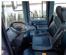
Broader Driving Space